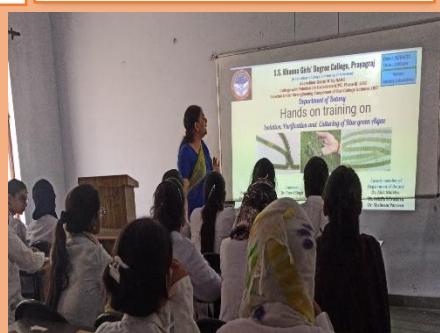
Hands on Training conducted by Botany Department on 26.04.2022