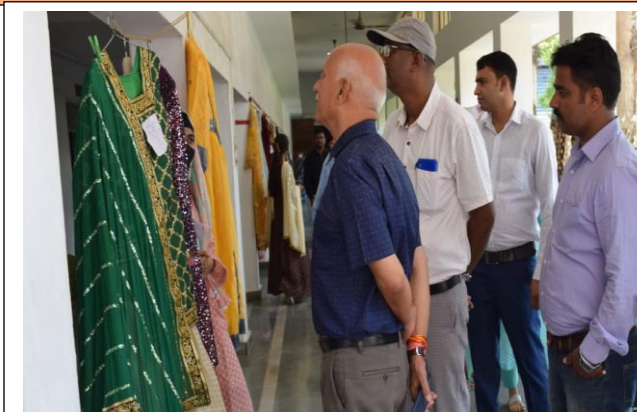
Exhibition of dresses made by Students on 07-05.22