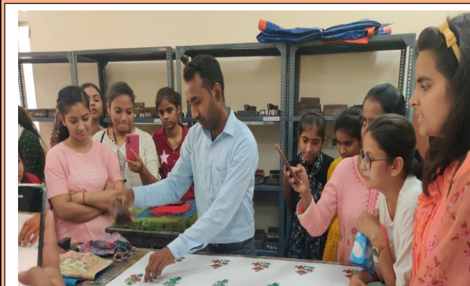
Industry Visit to Varanasi on 13.04.22