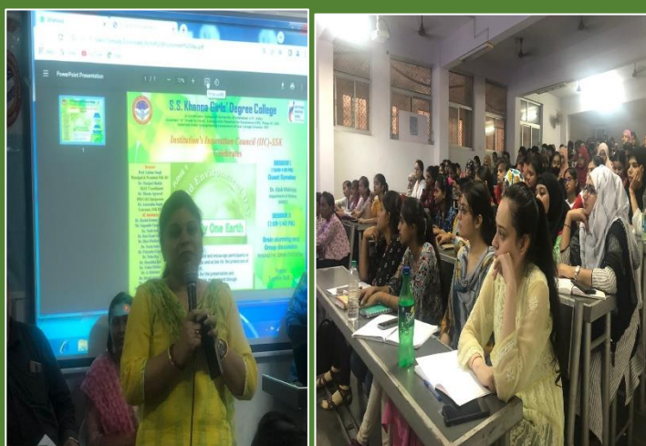
Special Lecture to Celebrate World Environment Day on 5 th June 2022