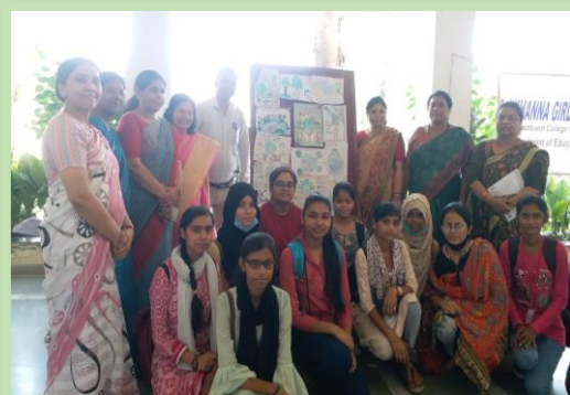
Poster and Slogan Competition was organized by Department of Education of the college on 22 nd April, 2022. The theme of the competition on Earth Day was 'Invest in our Planet.'