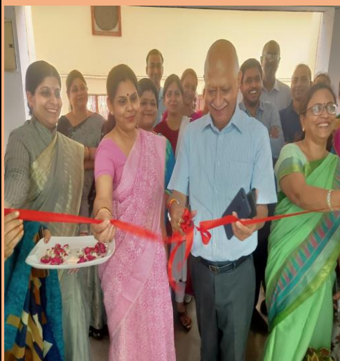
Inauguration of Zoology lab on 13.04.22