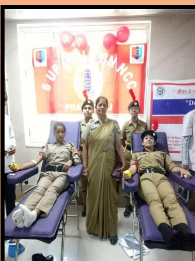
Blood Donation by NCC Cadets on 14.06.22