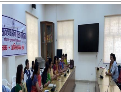
PTM of Science Faculty on 05.05.2022