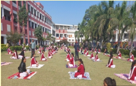
Yoga Activity on 09-02-23