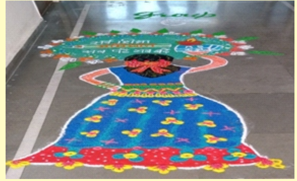
Rangoli Activity on 28-01-23