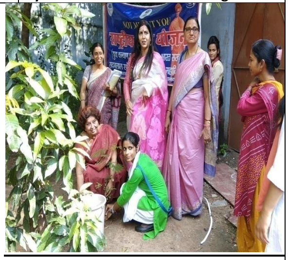
Plantation by NSS Volunteers