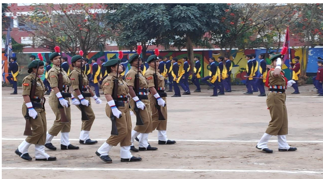
NCC Cadets of S.S.K.G.D.C. on Republic Day