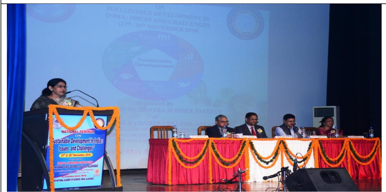
National Seminar on "Sustainable Development in India: Issues and Challenges" (27 th –28 th Nov 2018)