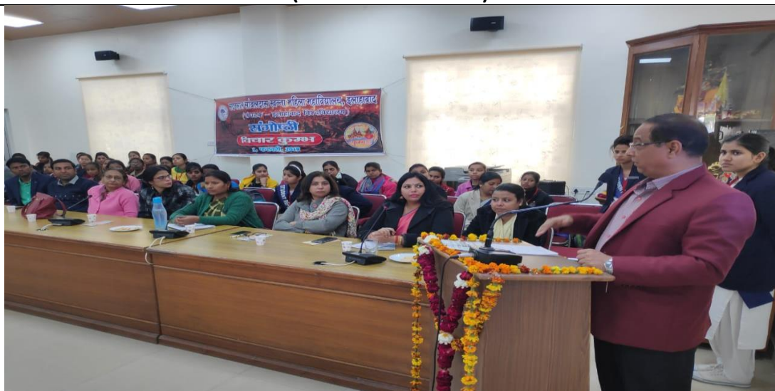
National Symposium on 'Vichaar Kumbh' on 1 st Feb 2019