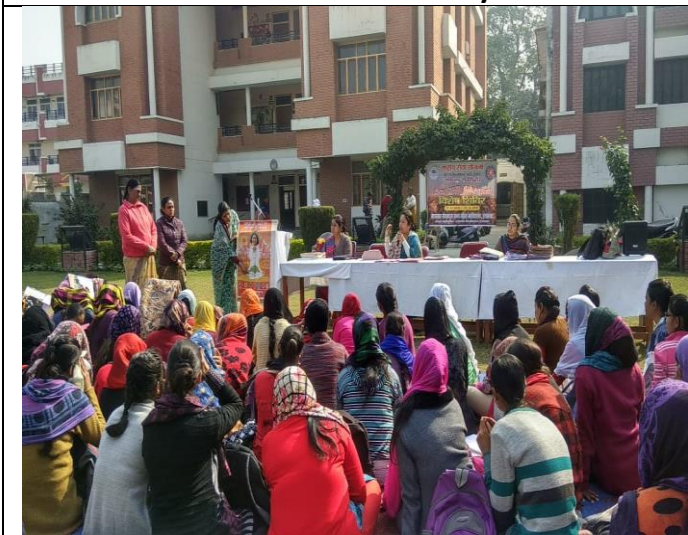
Special Camp of NSS