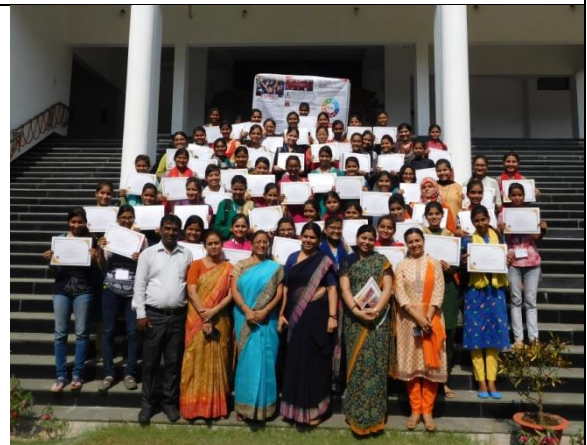
Career Development Programme by Mahindra Pride Classroom