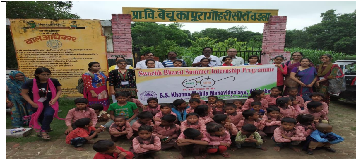
Visit to Gohri Gaon during Swachh Bharat Summer Internship Programme of GOI