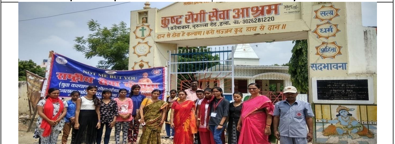
Visit to Kushth Rogi Seva Ashram by NSS Volunteers