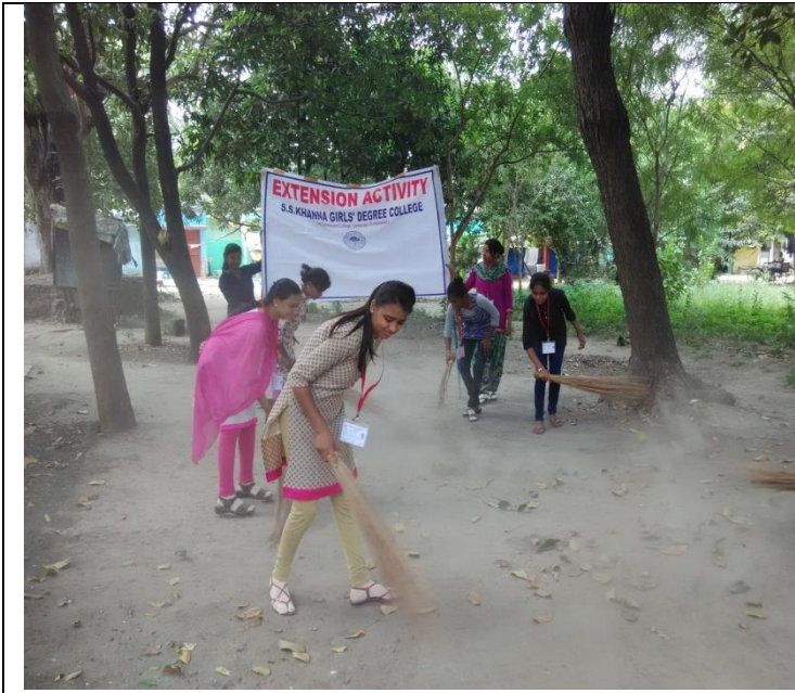
Cleanliness Drive by Students in Slum Areas under Extension Activity