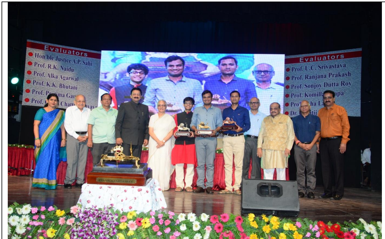
Winners of Damodarshree 2018 National Award for Academic Excellence