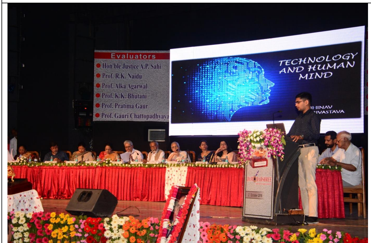
Damodarshree 2018 National Award for Academic Excellence on 2 nd October 2018