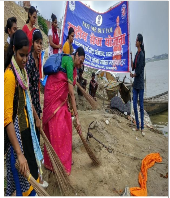
Participation in Ganga Safai Abhiyan by NSS Volunteers of the College