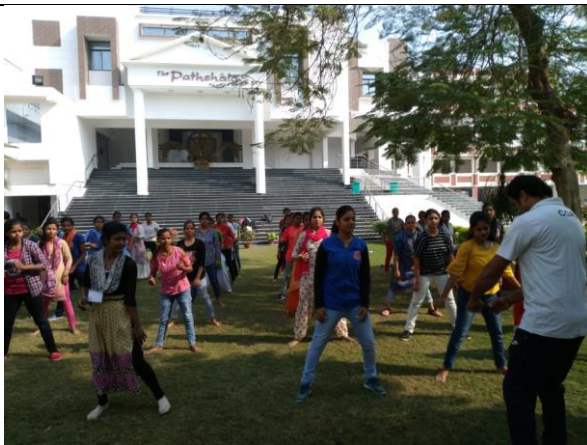
Self Defence Training Under Personality Development Programme under CPE Phase II